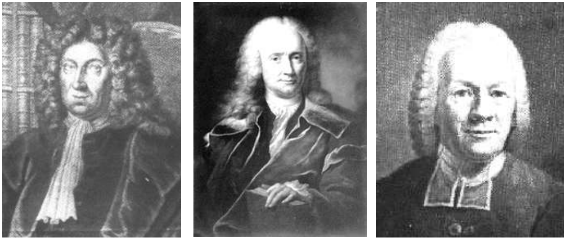
Fig. 2a/b/c. Rectors of the Thomasschule .